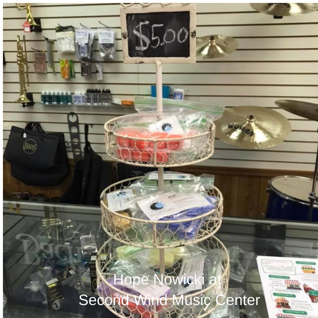
Hope Nowicki at Second Wind Music Center